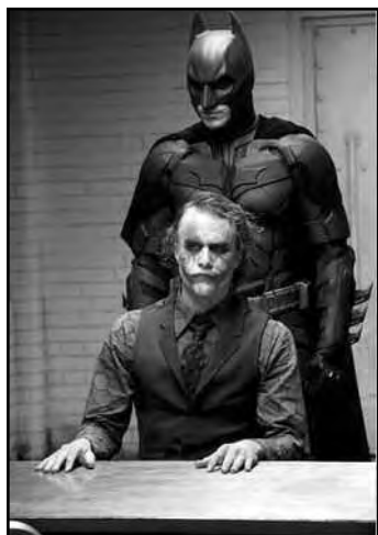
Christian Bale and Heath Ledger as the Batman and the Joker: a dynamic—and scary—duo.

“Good” and “bad” are indeed flip sides of the same coin. While this isn't a new concept, the exploration and presentation of this age-old notion is so dynamic it almost seems fresh—and particularly resonant in today's