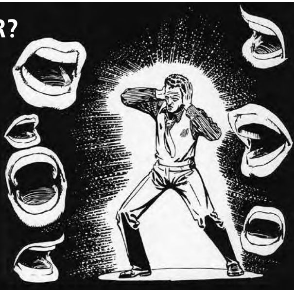
Illustration by Steve Ditko