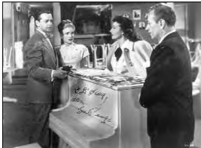
Pevney had one of his biggest roles in RKO's Nocturne (1946) in which he costarred with (left to right) Virginia Huston, Lynn Bari, and George Raft.