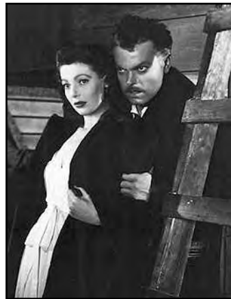
Loretta Young and Orson Welles in the often-underrated The Stranger .

In other spy-ring films, Nazis are portrayed as particularly capable of cannibalistic ruthlessness, thinking nothing of disposing of their own people. Claude Rains in Notorious —with its characteristic Hitchcockian MacGuffin of uranium ore hidden in wine bottles—is more fearful of his Nazi coconspirators than he is of the Americans.