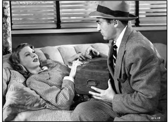
Jean Gillie and Sheldon Leonard in Decoy : some viewers find the film a gem of noir nihilism while others find its overcooked hard-boiled attitude hysterically funny.

Where laughter is typically the most cringe-inducing is when the films are screened with the surviving actors, actresses, writers, and directors in attendance. It seems cruel that they should have to endure an audience's ironic laughter. Foster Hirsch has seen this happen many times, and he says he is always "embarrassed for the audience and the celebrity." Veteran actress Marsha Hunt