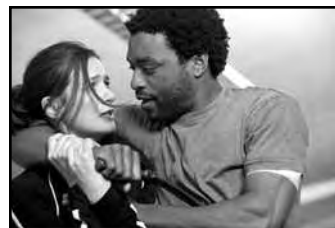
Emily Mortimer and Chiwetel Ejiofor in David Mamet's "fight noir," Redbelt .

The main protagonist, jujitsu instructor Mike Terry, is portrayed with carefully controlled passion by Chiwetel Ejiofor ( Talk to Me [2007], American Gangster [2007]). Noir is more of an internal journey than an